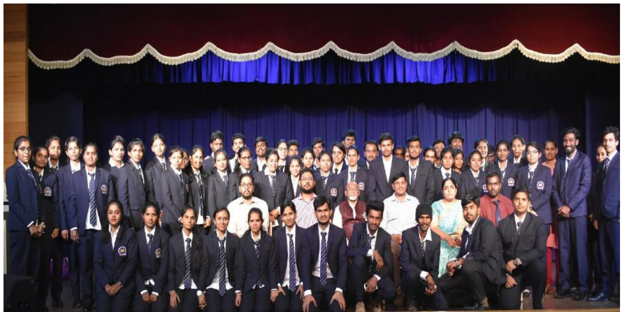
A Group Photo of student of M.com, M.com (FA), faculty and Resources person workshop On RUN, JUMP & FLY? .