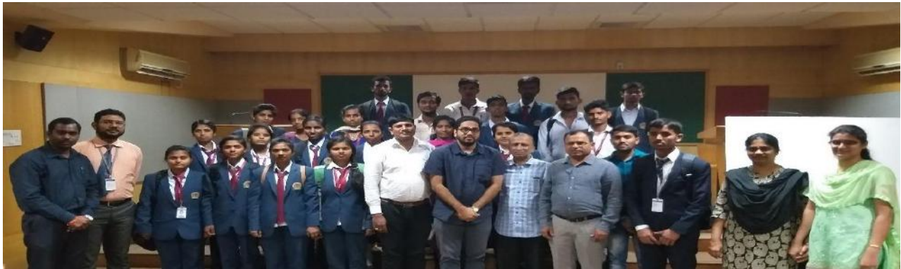
The Student of Government College, RC College and other colleges attending the workshop on “preparation for competitive examination –NET, KSET and Banking Exam”.